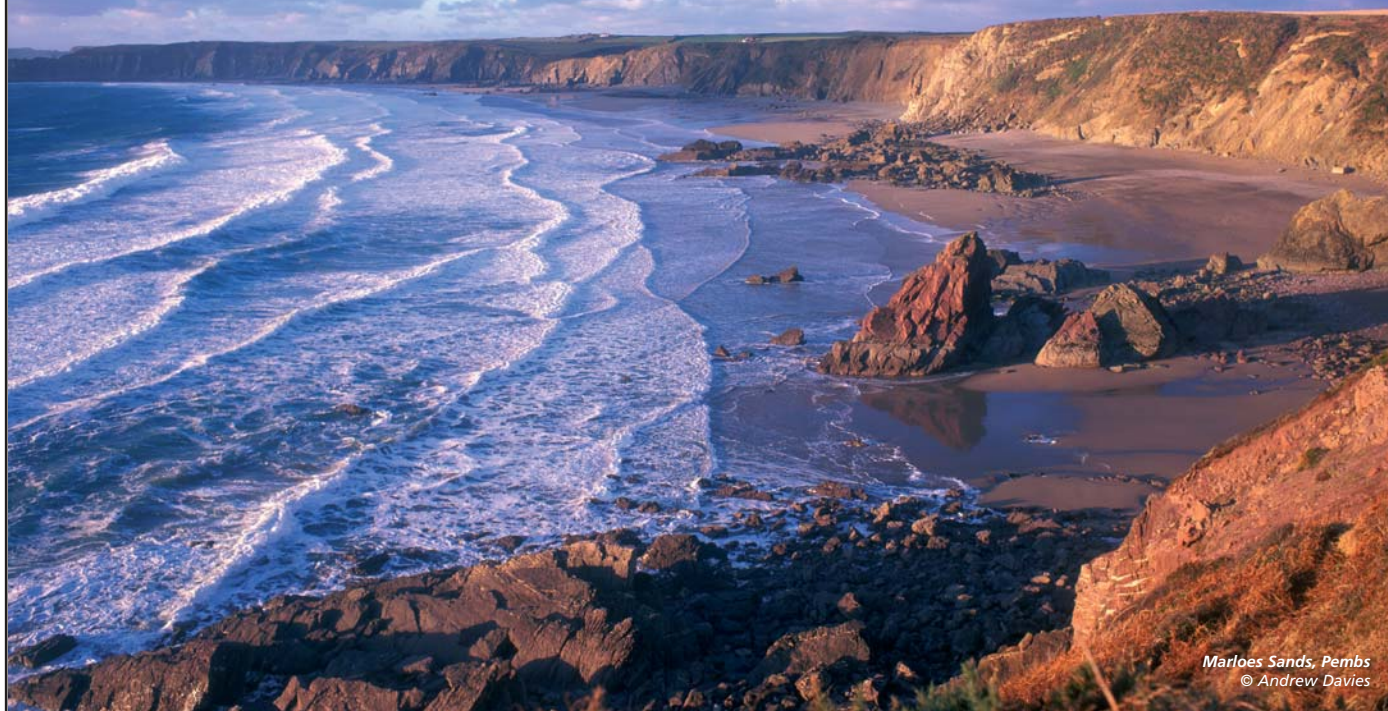
Marloes Sands, Pembrokeshire

Does the prospect of being able to walk the coast of Wales excite you? It will be a bit of a leg stretcher to walk the full 800 miles but securing high quality access around the edge of Wales would be quite a prize.