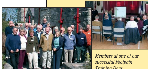
Members at one of our successful Footpath Training Days

For more information or to book your place please contact Mike Mills at Wales office on 029 20 644308 or email mikem@ramblers.org.uk