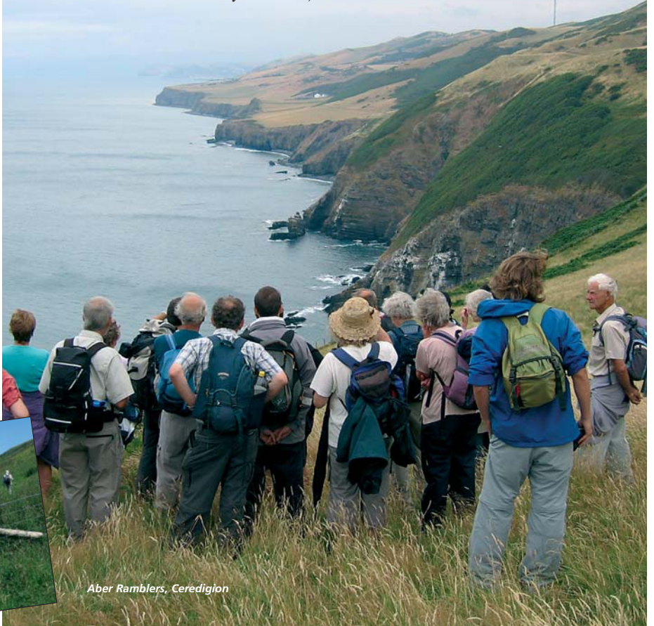
Aber Ramblers, Ceredigion

RA members involved in the new coastal access partnerships in other parts of Wales could well benefit from a close study of the Ceredigion case.