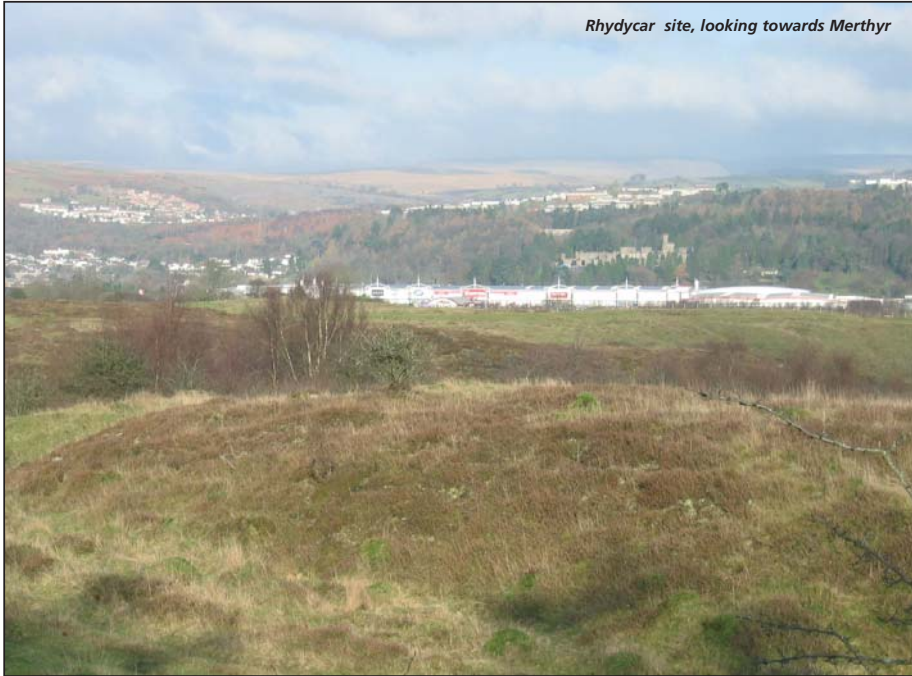
Rhydyicar site, looking towards Merthyr

It is really important then that Countryside Secretaries or Footpath Officers register with the local authority to receive planning applications affecting footpaths. Forewarned is forearmed!