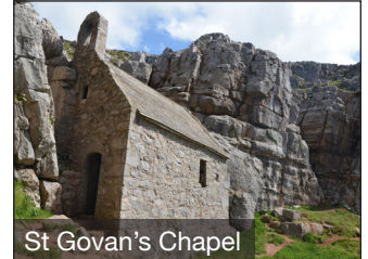
St Govan's Chapel