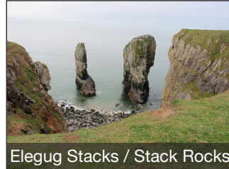
Elegug Stacks / Stack Rocks